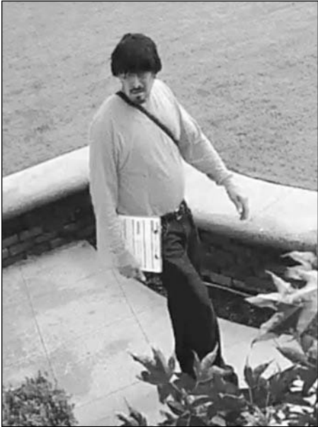
ABOVE: Suspect in attempted burglary of home in 7400 block of Calle Privada. BELOW: Vehicle of suspect.

The suspect is described as Hispanic, in his 30s, 5 feet 8 inches to 5 feet 10 inches tall, 200 pounds, black hair that was possibly a wig, medium complexion, black mustache and goatee. He wore an orange long-sleeve shirt, dark blue jeans and black shoes.